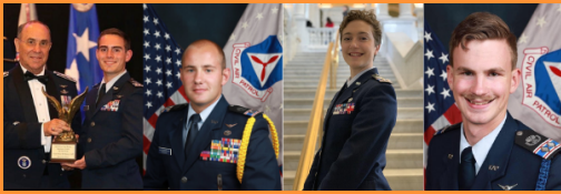
National Cadet Advisory Council Panel